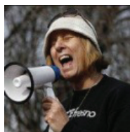
Cindy Sheehan , US peace activist, Soapbox radio host, Peace of the Action founder & author.